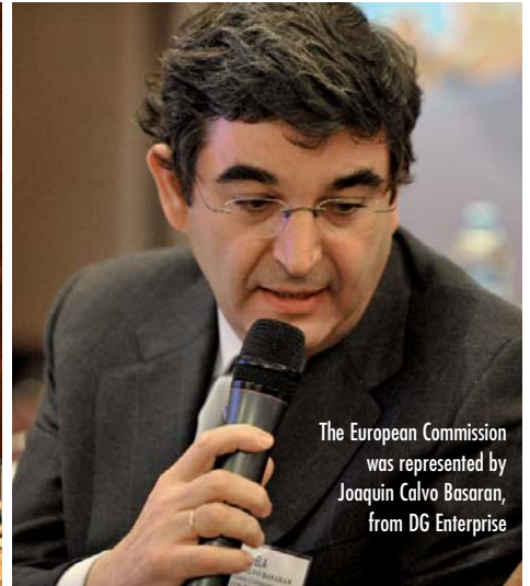
The European Commission was represented by Joaquin Calvo Basaran, from DG Enterprise